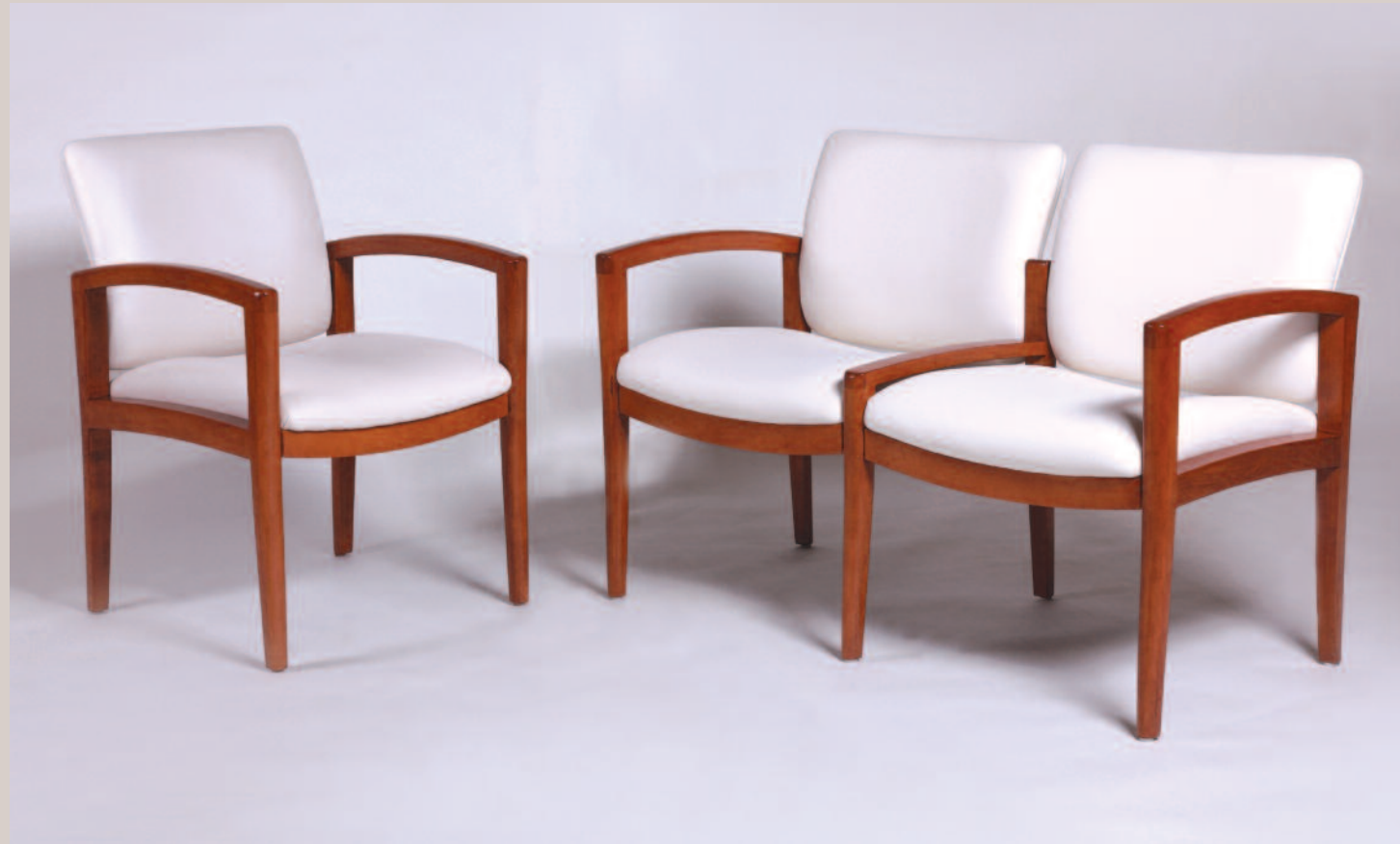
470 Guest Chair

OCI Contract is proud to introduce Response . Available in a single seat Guest Chair, two seat Settee or Bariatric version. This line also premieres our new Wood Arm with Poly Arm Cap. This combination gives you the beauty of wood but the durability of poly. Arm construction is made from maple hardwoods with all of OCI's 16 different wood finishes. Choose from any of our 300 fabric options, Faux Leather or Genuine Leather. . We can also use your COM or Graded in fabrics from Momentum, CF Stinson or Mayer, just to name a few. Please call OCI Contract for more information.