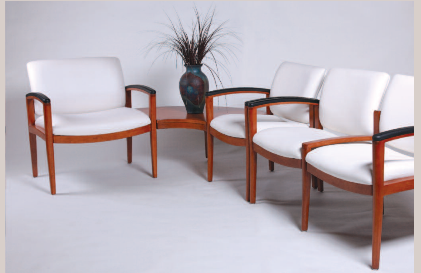
484LS - T2121RCT Round Corner Table - 480RS - 482