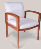
470 Guest Chair