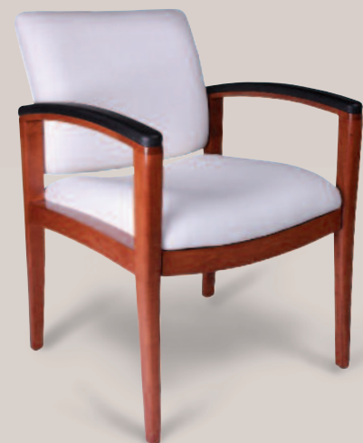
480 Guest Chair