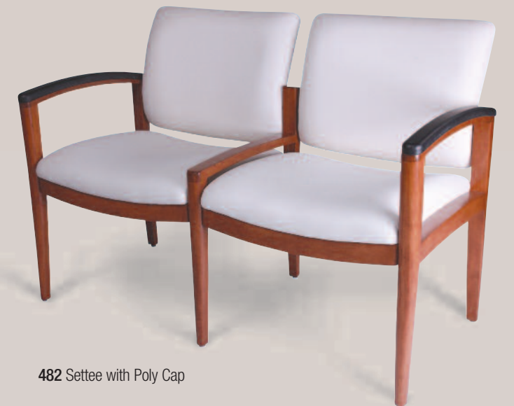
482 Settee with Poly Cap

480 Poly Arm Cap for added comfort and durability.